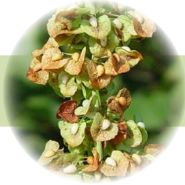
Rumex crispus (Yellow dock)