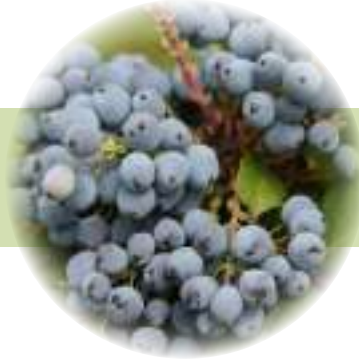
Berberis aquifolium (Oregon grape)