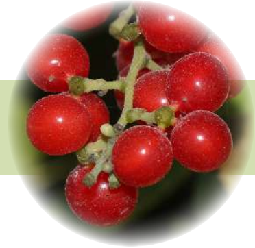
Smilax spp. (Sarsaparilla)