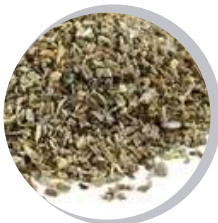
Root of E. Angustifolia

Echinacea alone, either the root of E. angustifolia or E. purpurea , has helped countless patients with poor immunity in doses equivalent to 2.5 - 7.5 g/day (5 - 15 ml of a 1:2 preparation)